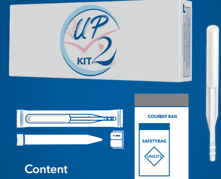
V-Veil UP2 KIT 4.1 14mm Self-Sampling Veil