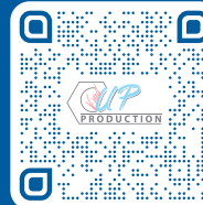
V-Veil UP2 KIT 1.1 14mm Self-Sampling Veil