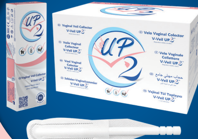
V-Veil UP2 28mm Self-Sampling Veil

Our products are available in: - individual packaging; - collective packaging of 250 pcs.; - bulk at 1000 pcs.