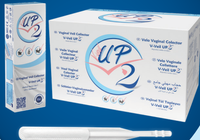
V-Veil UP2 14mm Self-Sampling Veil